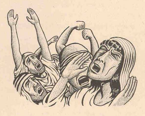
After the manner of Egyptians, the Israelites wept and wailed all night because of those who had been killed trying to reach Canaan.

It was a case of the Israelites breaking their agreement with God, which meant that God was no longer bound to give them the help, guidance and protection that He had promised to give if they would obey Him.