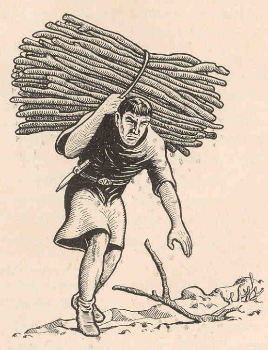
A man was reported to be spending the Sabbath gathering wood for his fire.