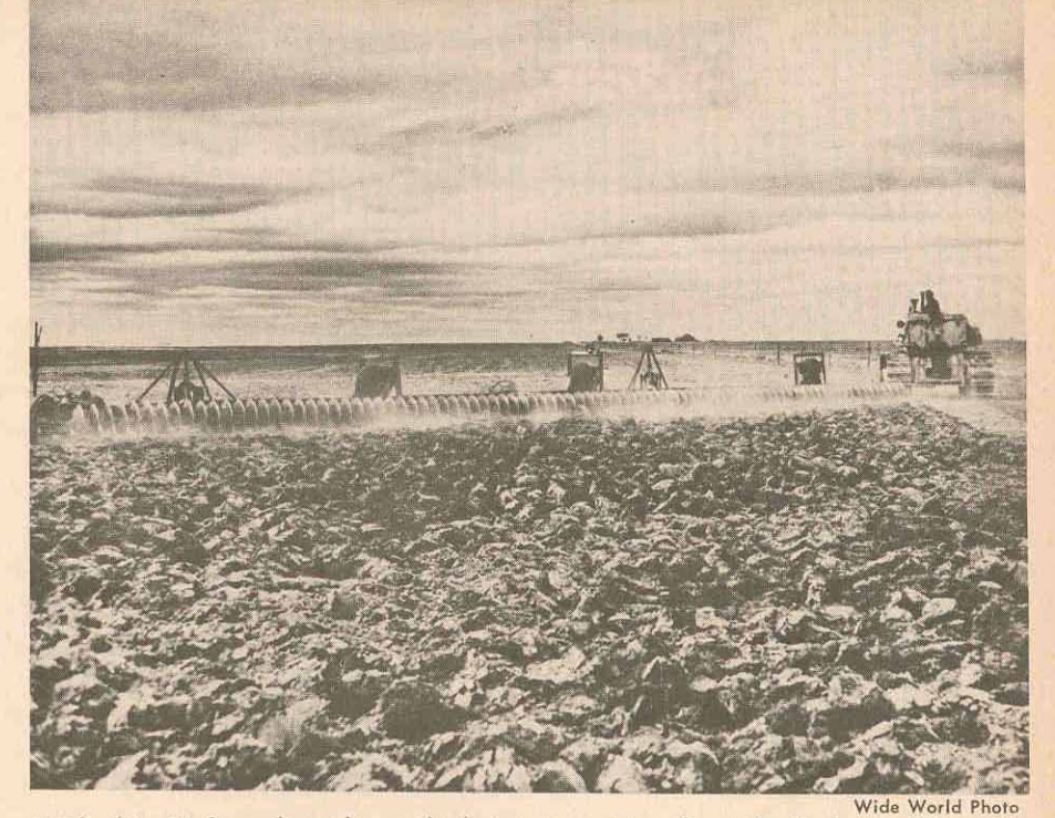
With this 60-foot disc plow which turns a strip of earth 42 feet wide at a rate of 14 acres an hour, man can destroy the life of the land much faster than did his ancestors if he does not follow the right farming methods.

This paper mill waste, usually referred to as sulphite liquor, is a much worse polluting agent even than sewage, although the latter is probably the one that we are most generally disturbed by, since now most of our rivers are polluted by it. I am making this introduction to show you that "waste products" is really not the proper name. They should better be called "by-products" because they are seldom useless