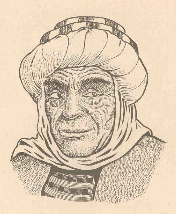
Korah smiled to himself, certain that he was well on the way to take over the leadership of Israel.