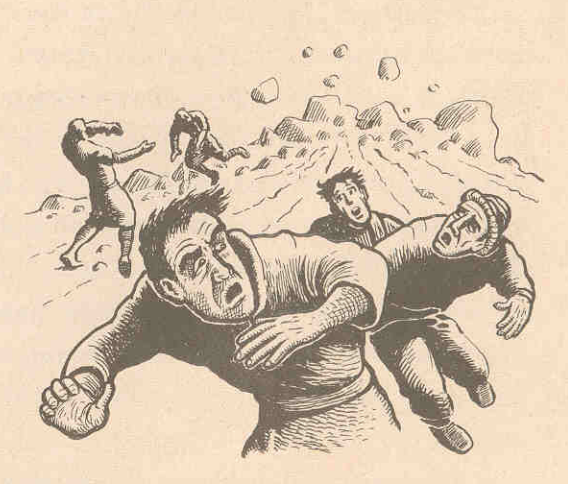
The ground near the tents of Korah, Dathan and Abiram began to heave upward!